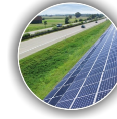
EB Solar System